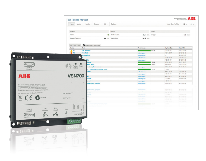
VSN700 Data Logger and web user interface