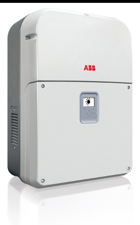
ABB string inverters cost-efficiently convert the direct current (DC) generated by solar modules into high quality three-phase alternating current (AC) that can be fed into the power distribution network (i.e. grid). Designed to meet the needs of the entire supply chain – from system integrators and installers to end users – these transformerless, three-phase inverters are designed for decentralized photovoltaic (PV) systems installed in commercial and industrial systems up to megawatt (MW) sizes.